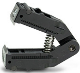
Interchangeable blade pair