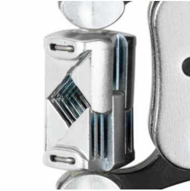
Optimal square crimping profile