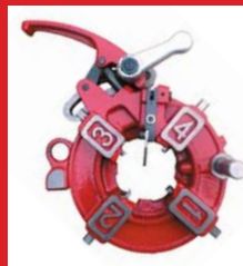
NV-type Die head