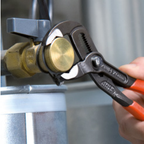
Fast and firm adjustment directly on the workpiece