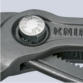
Fine adjustment by pushing a button: fast and comfortable.