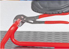
Teeth set against the direction of rotation have a self-locking effect and prevent slipping on the workpiece.